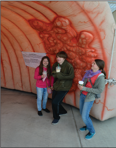
MESA Day contestants are stunned to see “cancer” in the giant inflatable colon.