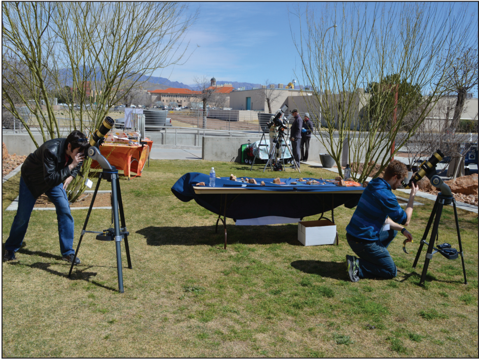
New Mexico State University graduate students align solar telescopes for use by MESA students at the 2015 High School MESA Day on the NMSU Campus. More than 400 students had the opportunity to gaze upon the sun in all its glory.