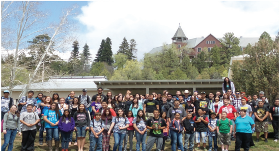
North Region students pose at World College.

Well, the school year is almost over. I would like to thank all the students and advisors for another great year in the North Region. This year MESA Day was another great success at both the middle and high school levels. However, we had a hiccup with the High School MESA Day due to one of the winter’s biggest snowstorms, causing many high schools, including most in the north region, to cancel the trip to Las Cruces to compete. But we had one lonely school (Springer) travel through “ten feet” of snow to participate in the Las Cruces event. I want to actually congratulate them for representing the North plus they were able to take third place in the Brain event. The North Region advisors also decided to have a makeup MESA Day for the schools that couldn’t attend the original MESA Day due to snow. The high school students that participated brought their “A” game on makeup day, running all the same events. Competing schools were able to obtain scores that would have placed them at MESA Day. Robertson High School team 4 would have tied for first place in the arm, West Las Vegas team 6 would have taken 3rd, West Las Vegas team 5 would have taken 3rd overall, and West Las Vegas team 6 would have taken 9th overall. The North also had the great privilege