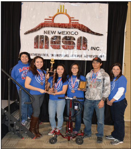
Las Cruces High School Team #1 hoists their overall championship trophy after winning the 2015 MESA Day title by less than one point over cross-town rival Mayfield. Dominating the brain event was their key to success.