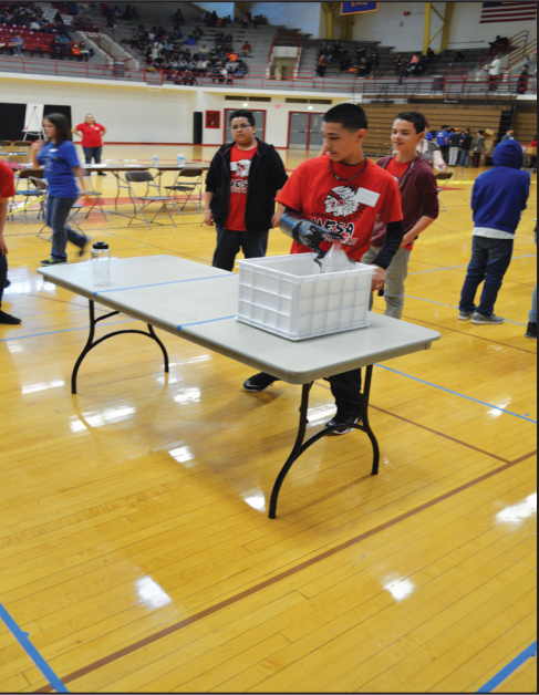
The CC Snell MS Team competes in the prosthetic arm event in Johnson Gym.